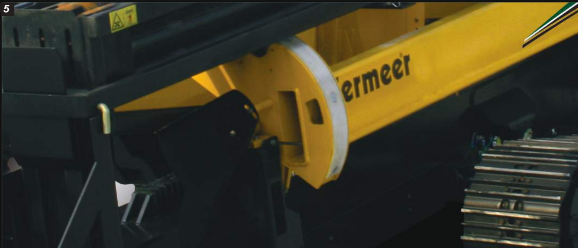
5: Optional front-mounted stakedown system : helps reduce the amount of time and materials needed to set up the drill for enhanced jobsite efficiency.